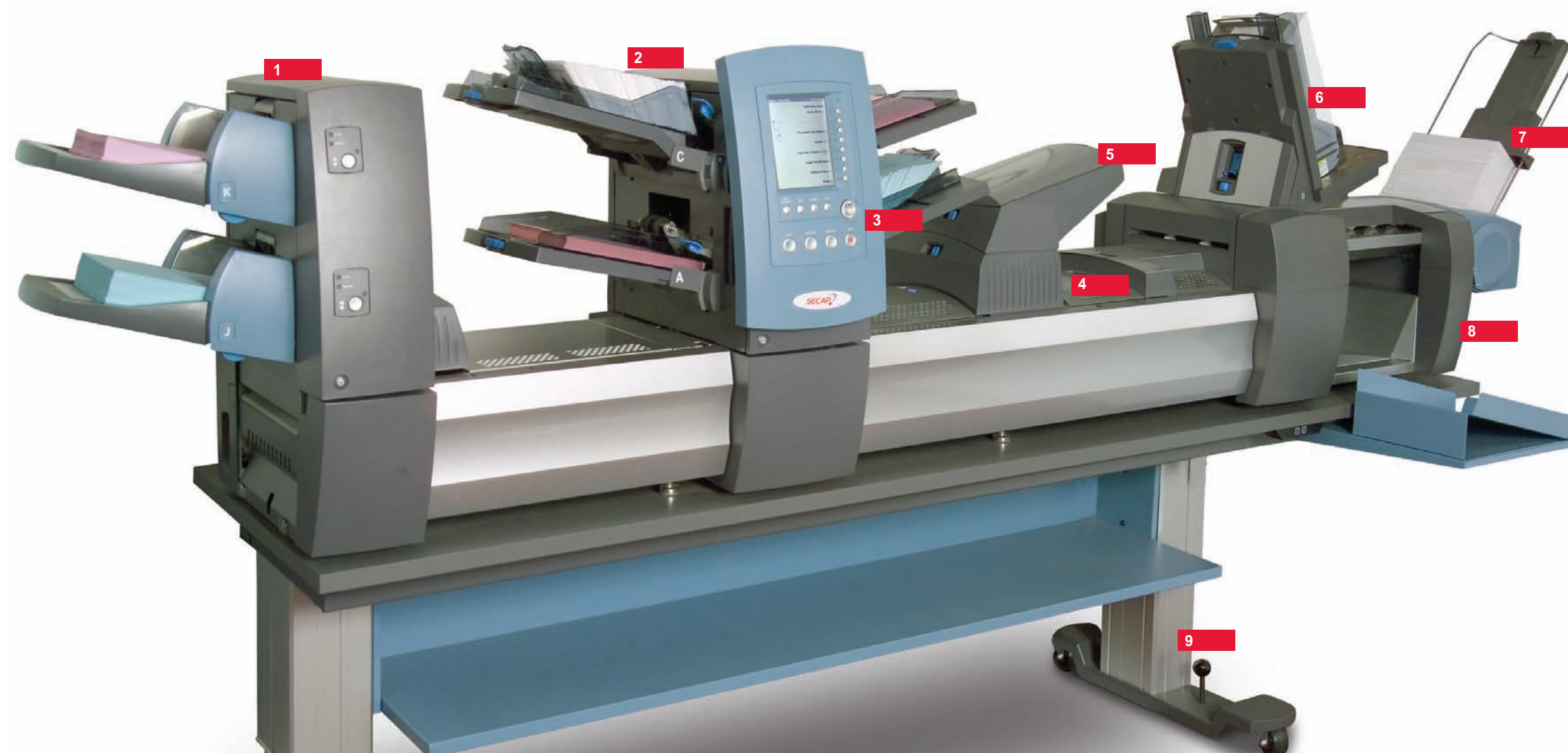
SI5400-4H shown with optional add-ons: high capacity sheet feeder, inverter kit, vertical power stacker, exit transport and table.

SI5400-4 Four Feeder Tower & High Capacity Envelope Feeder Up to 5,400 pieces/hr. Max Dimensions: 31"H x 89"L x 22.8"D Weight: 349 lbs.